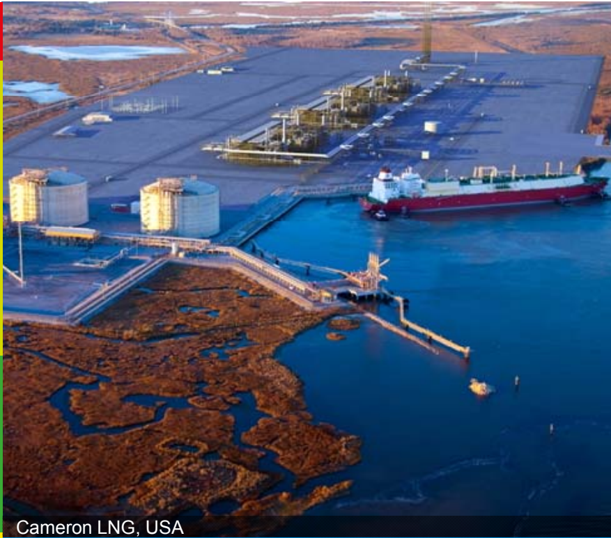
Cameron LNG, USA